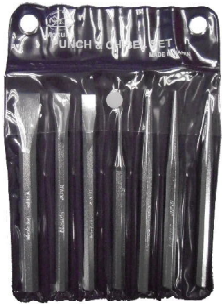
7-Pc Punch & Chisel Set