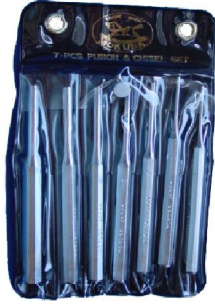
7-Pc Pin Punch Set