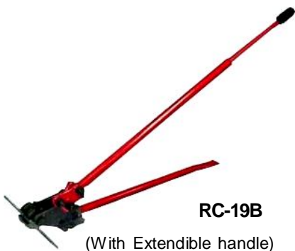
RC-19B (With Extendible handle)