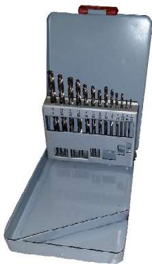
S13 In metal case.