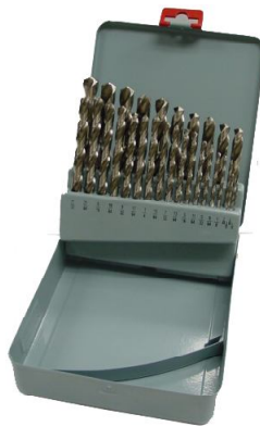
S21 S29 In metal case.