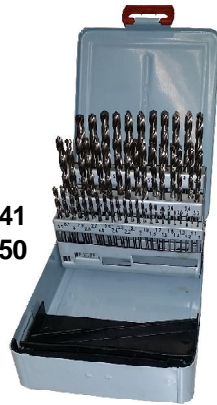
In metal case.