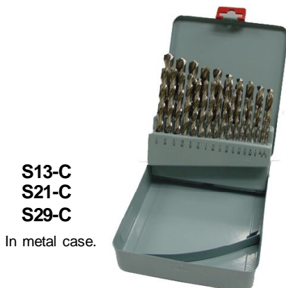
S13-C S21-C S29-C In metal case.