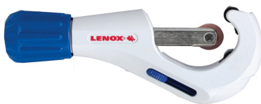
TC13/8 TC13/4 TC25/8