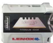
20351 (50-Pc Pack with Dispenser) Dispenses 1 or 5 blades at a time