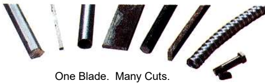
One Blade. Many Cuts.