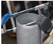
Tuff Tooth™ : All