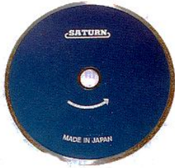
110, 125, 180 & 230mm