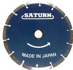
105, 125, 180 & 230mm