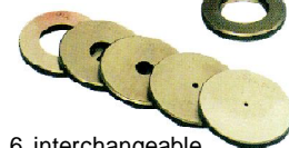
6 interchangeable blades